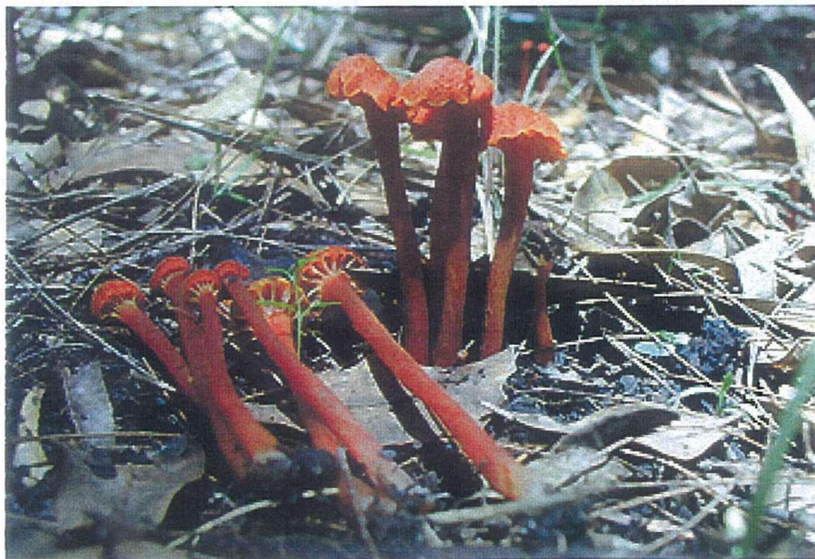
Figure 2. Hygrocybe boothii under natural conditions in eucalypt/casuarina woodland.